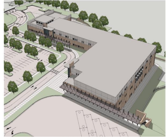
OVERALL VIEW FROM NORTHWEST EAST SIDE ELEMENTARY SCHOOL COBB COUNTY, GEORGIA COBB COUNTY SCHOOLS DISTRICT Brookwood P&S JEA Architects

Crush! I bet most of you are wondering about the construction going around East Side due to the demolition of the third and fifth-grade playground. Well, it's happening because there is going to be a new school. There is going to be sixty-nine classrooms and three stories in it, too! The top level will be for fourth and fifth grade, the middle level for second and third grade, the office, specials, cafeteria, and brand new stage . If you live on Clubland Drive, directly behind the school, you probably can hear all the noise, but the construction people are trying the best they can so that they don't disturb the residents of Clubland Drive. Despite the noise, there is going to be a bigger cafeteria with a bigger stage and an atrium! But they are going to be using the same playgrounds, instead of building new ones. And if you're an environmentalist or something in that category, then good news for you! They're going to replant all of the trees they cut down, and replant the DEAR Garden. The ribbon will be cut in 2011, so enjoy the new school! Here is a photograph of what the new school is supposed to look like.